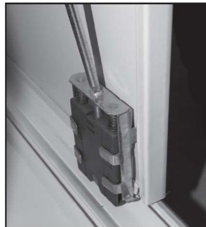
Step 5 - Adjust the ride height of each door with a phillips screwdriver (clockwise to increase height).