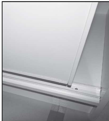
Step 4 - Lift the door and position its bottom wheels into their corresponding guide on the wardrobe floor.