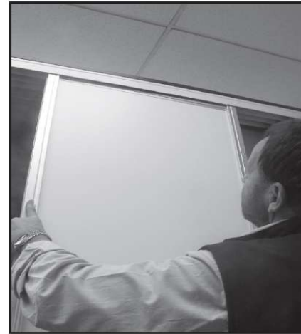
Step 3 - Slip top of door into rear channel then set bottom onto the rear floor track. Repeat for second door using front channel and track.