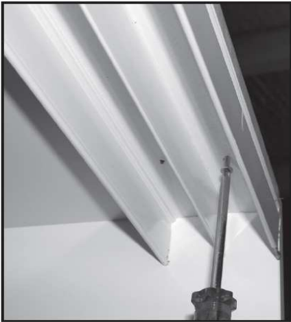
Step 1 - Position the top door track flush with the front of the wardrobe and secure using the screws provided.